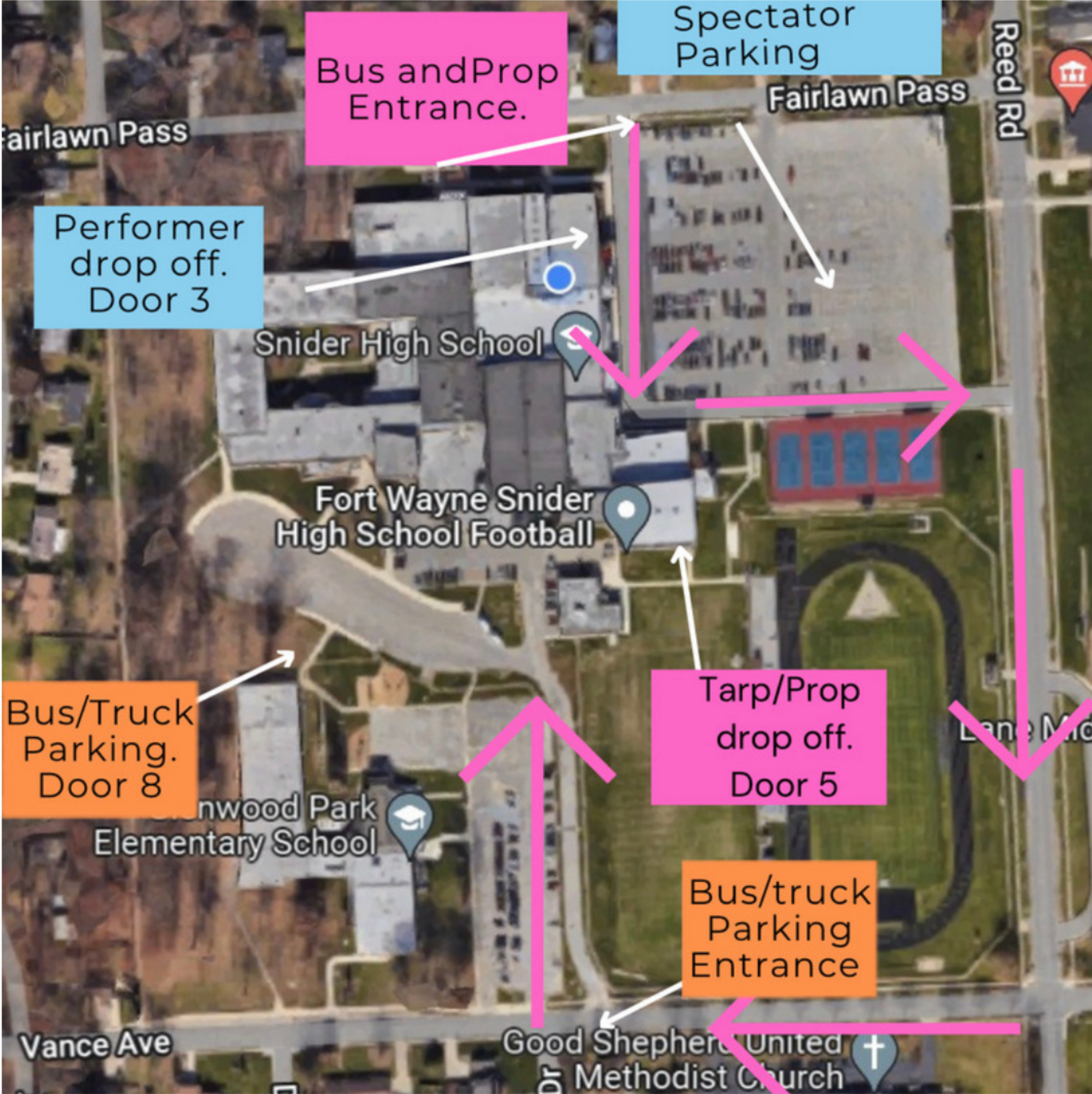
Buses and Prop personnel follow pink arrows for drop off and parking.